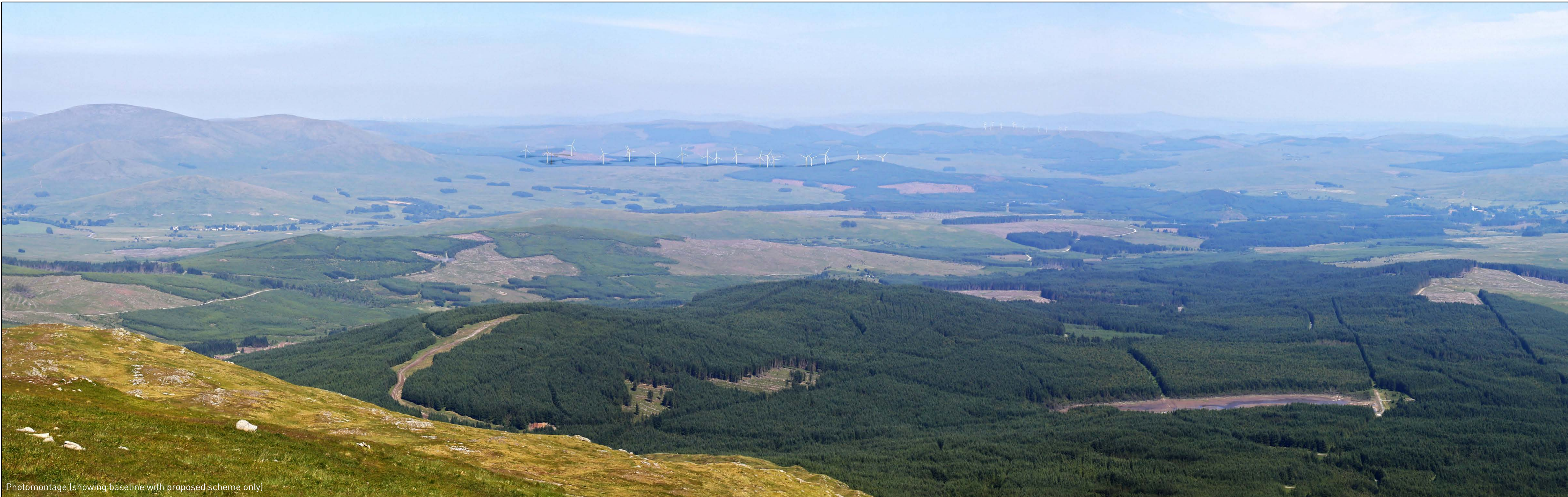
Photomontage (showing baseline with proposed scheme only)